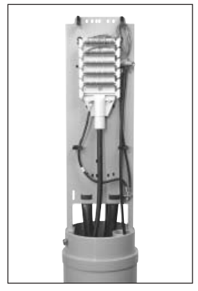
CFP800 Shown With 25-Pair Mini-Rocker Terminal Block

Mini-Rocker Tailed Terminal Blocks are ideally suited for both indoor and outdoor applications. HVC encapsulation eliminates corrosion, enabling the Mini-Rocker Blocks to function in high-humidity environments. The Mini-Rocker Block is equally at home in aerial, pedestal, wall mount, marina and subsurface installations.