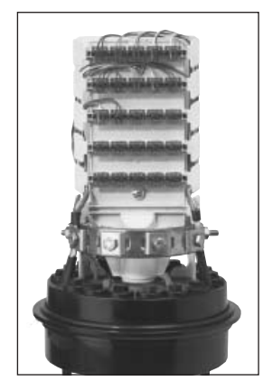
BMT609 Shown With 25-Pair Mini-Rocker Terminal Block